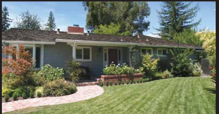
OPEN SUNDAY 1:30 - 4:30 150 DOHERTY WAY, REDWOOD CITY REMODELED 3 BEDROOM, 2 BATH RANCH-STYLE HOME AT END OF CUL-DE-SAC ON 8,319 SQ. FT. LOT OFFERED AT $1,075,000