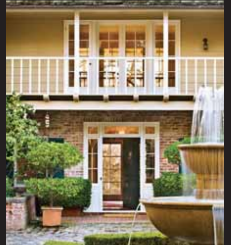
SHOWN BY APPOINTMENT WOODSIDE PRIVATE ESTATE ON APPROX. 21 ACRES WITH GUESTHOUSE, POOL, SPA, TENNIS COURT, AND EQUESTRIAN FACILITIES. NEW PRICE $6,500,000