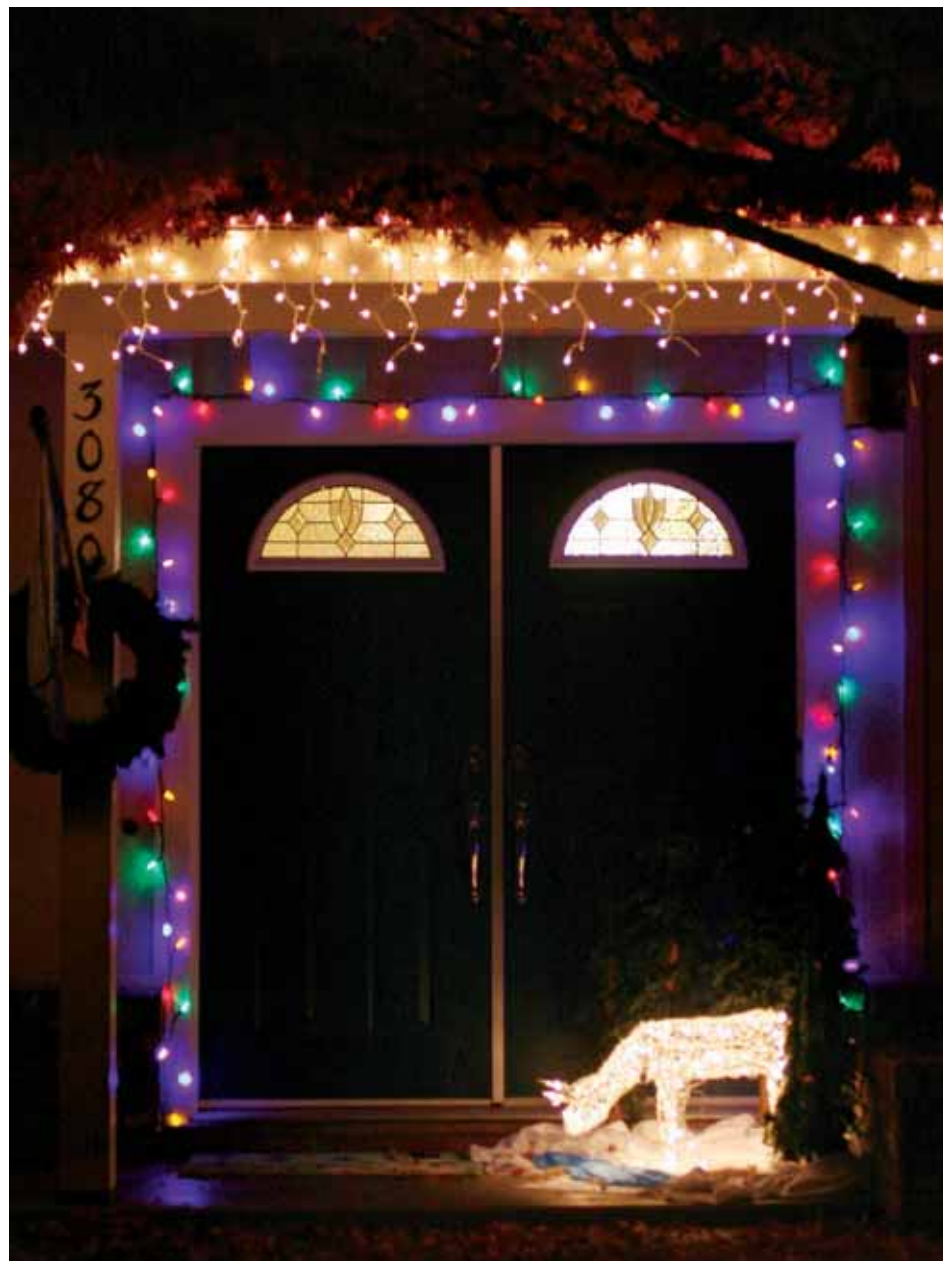
A string of purple and red LED lights, above, add to the holiday spirit while lowering energy use on this decorated Palo Alto home. Left, cut Christmas trees, such as these noble fir branches, don't negatively impact the eco-system, because they are farmed and ultimately composted.

each year, and it takes six to seven years for Christmas trees to grow to maturity.