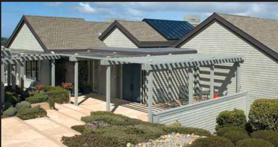
OPEN SUNDAY 1:30 - 4:30 1 HORSESHOE BEND, PORTOLA VALLEY UNIQUE CUSTOM HOME WITH INCREDIBLE VIEWS OF THE BAY AND WINDY HILL. PORTOLA VALLEY SCHOOLS. CO-LISTED GINNY & JOE KAVANAUGH NEW PRICE $3,750,000