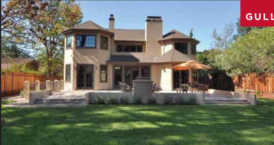
OPEN SUNDAY 1:30 - 4:30 1775 VALPARAISO AVENUE, MENLO PARK NEW 3-LEVEL CUSTOM HOME ON 12,000 SQ. FT. LOT. 5 BED/6.5 BATHS. MENLO PARK SCHOOLS. CO-LISTED WITH STEVE & JULIE QUATTRONE NEW PRICE $2,995,000