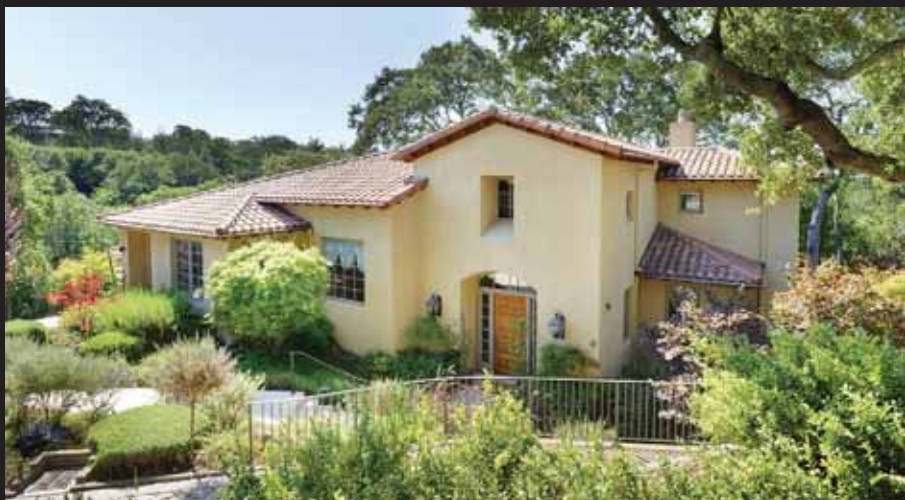
SHOWN BY APPOINTMENT PORTOLA VALLEY 5 BEDROOM, 5+ BATH CUSTOM HOME ON 2.6 ACRES IN WESTRIDGE WITH BAY VIEWS. PORTOLA VALLEY SCHOOLS. OFFERED AT $4,850,000