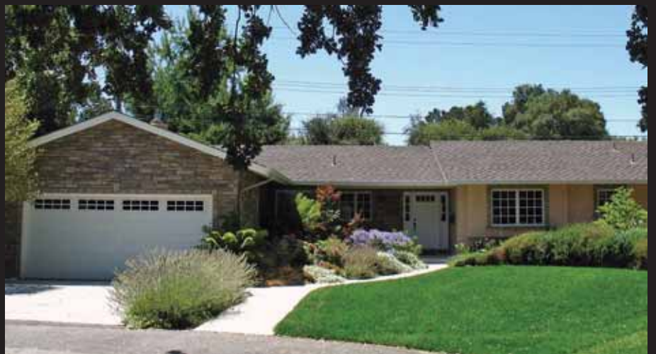
SHOWN BY APPOINTMENT MENLO PARK EXTENSIVELY REMODELED 4 BEDROOM, 3 BATH HOME ON 10,200SF LOT. MENLO PARK SCHOOLS OFFERED AT $2,250,000