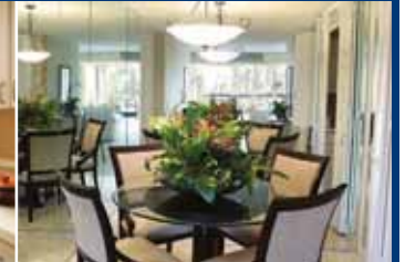
Dining area with mirrored surround; 24-hour staffing service, among the many first class amenities of "The Palo Alto"!