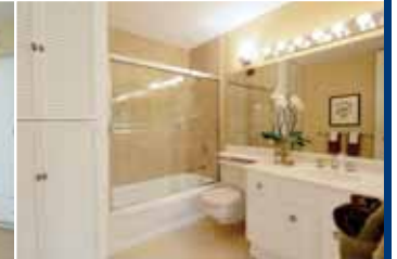
Master bath has separate vanity/dressing area and shower over tub with new glass sliding door and Crema Marfil surround

between Palo Alto Avenue and Hawthorne Avenue, off El Camino Real