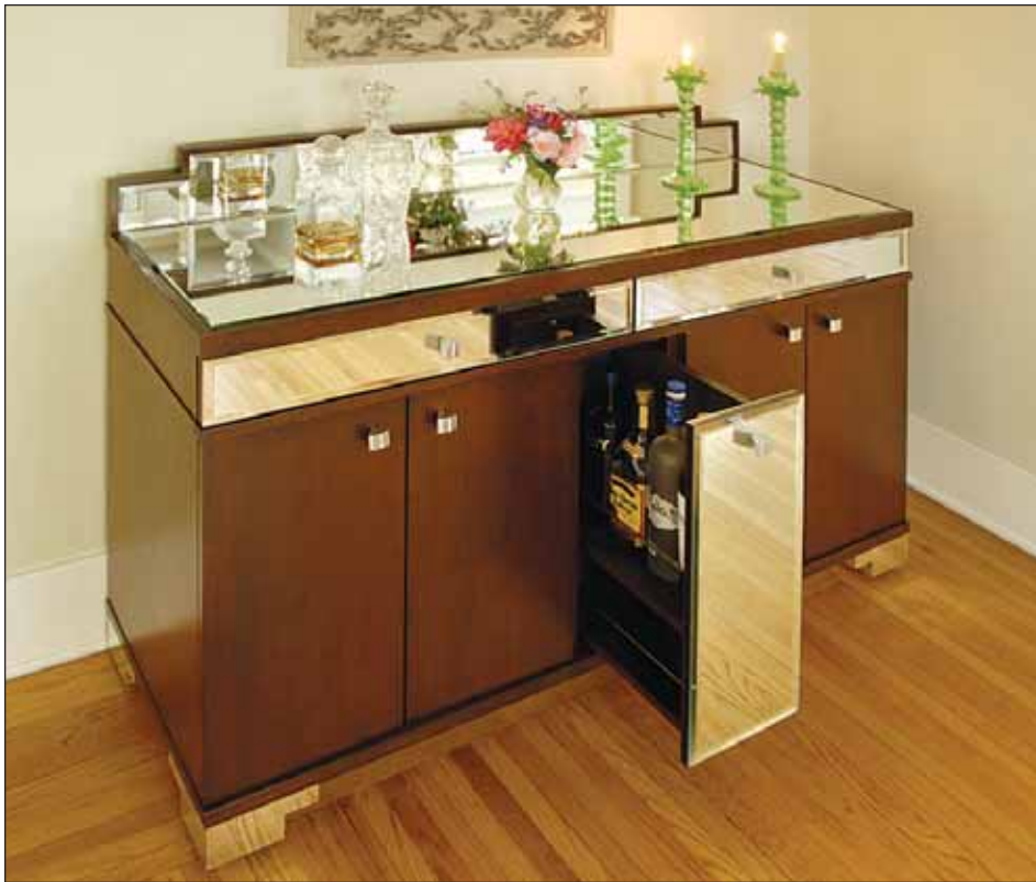
Interior designer Carol Lippert fashioned a mirrored dining-room cabinet to fit the mood of a 1930s-era cottage.