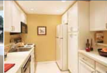
Efficient kitchen with freshly painted cabinets and recessed lighting includes stainless steel sink, a dishwasher, stove and microwave