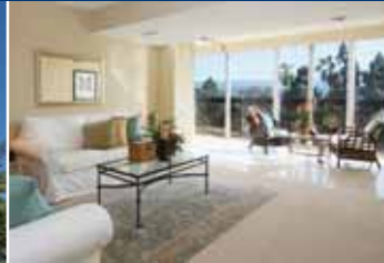
Spacious living room with new Berber carpet opening to sunroom with beautiful views of the foothills and pool below