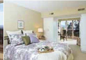
Master bedroom suite with adjoining sitting room/den/guest bedroom