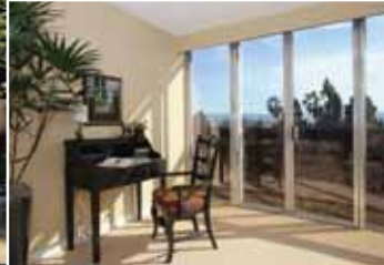
Naturally light-filled sitting room/den/guest bedroom with wonderful views of Stanford campus and Hoover Tower