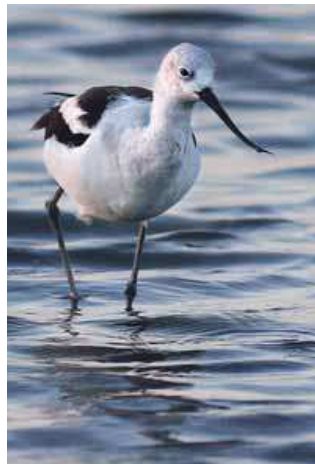
At top: A pair of ducks fly away from a channel at the Palo Alto Baylands during a rosy hued sunset; above: An American avocet, seen in its winter plumage, searches for food in the Baylands water; below: The many pools of water in the marshes are visible from atop Byxbee Park, facing east.